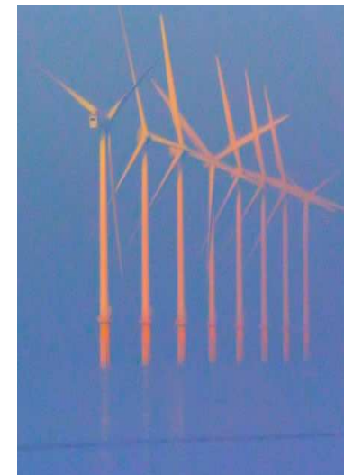
pro DANUBE ofrend.com INTERNATIONAL