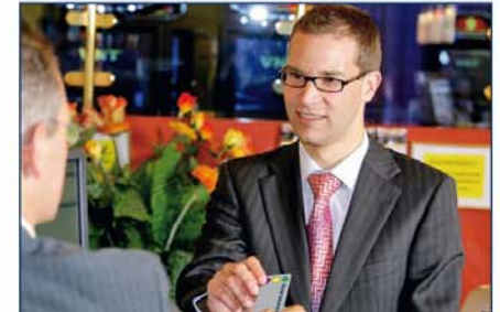
Handing over NOVOCARD