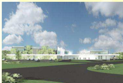
EBG MedAustron, Austria

Prosperity in the region , i.e. fostering of projects aimed at increasing research capacity, improving the education system, developing information technology and promoting business competitiveness – with top priority for projects designed to improve vocational training.