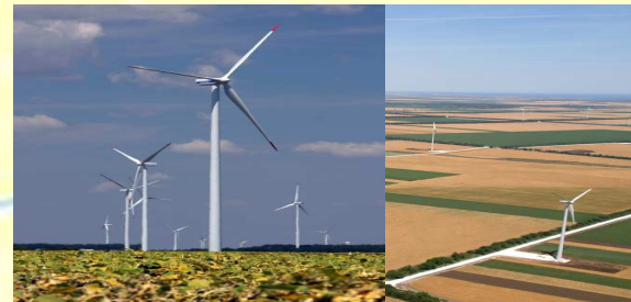
AES Geo Energy, Bulgaria