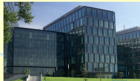
Digital Park Bratislava, Slovakia