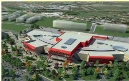
Arena Centar, Zagreb, Croatia

Better government in the region , i.e. fostering of projects aimed at better urban development and enhancing institutional capacity.