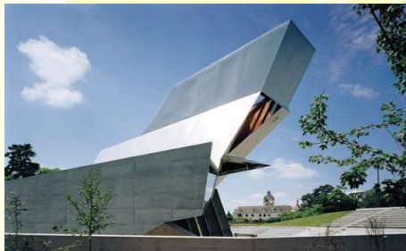
Grafenegg Cultural Centre, Austria

International integration of the regional economy , i.e. fostering of projects targeted at promoting mobility, the use of renewable energy sources, culture and tourism.