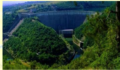
National Electric Company, Bulgaria