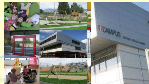
PPP – Campus Model, Austria