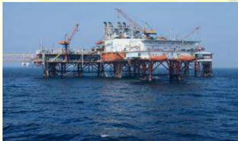
Petrom SA, Romania

Environmental protection , i.e. fostering of projects designed to restore water quality, manage environmental risks and maintain biodiversity.